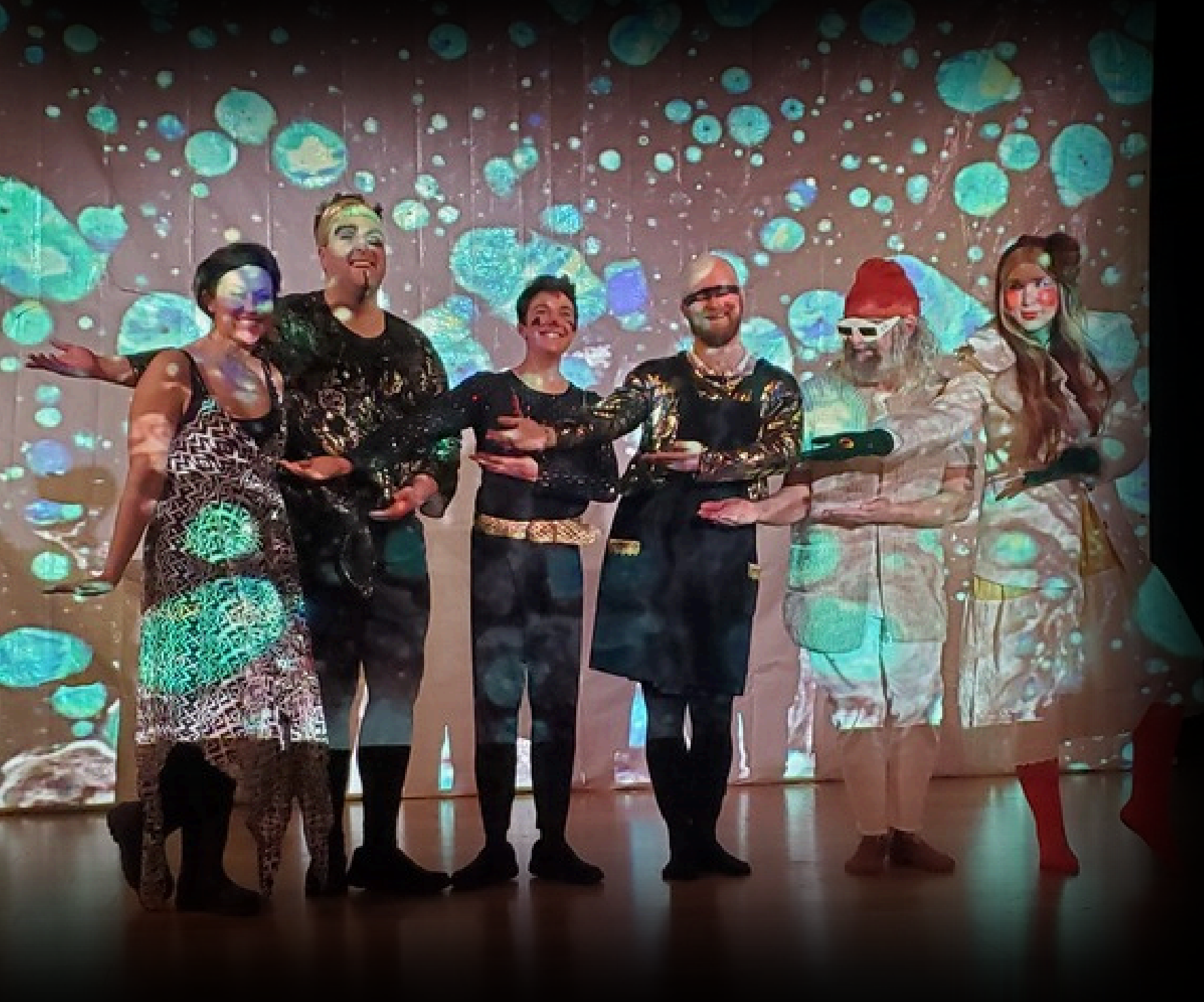
Celebrating a performance of DOT

We are stronger together and are grateful for our community partners.